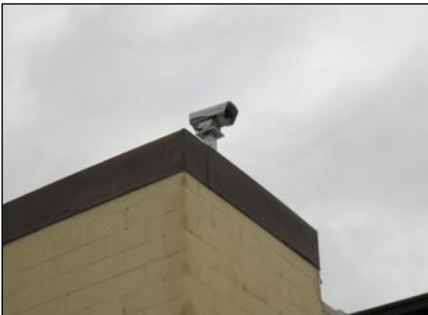
Figure 4. Heavy post mount clears the parapet.

Another issue is orientation of the beam direction. If installed East-West it is possible one of the FSO devices could go into “Sun Protection” mode. This occurs for Canobeam devices when sunlight enters the receiver within 0.3 degree of the beam transmitted by the other FSO in the pair. Should this occur, the device will shut down the re-