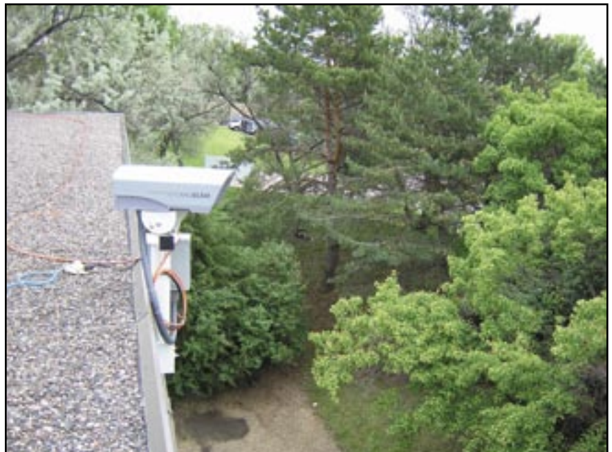
Figure 3. Canobeam FSO mounted on the edge of a roof; its beam will not be affected by heat or venting from the roof itself.