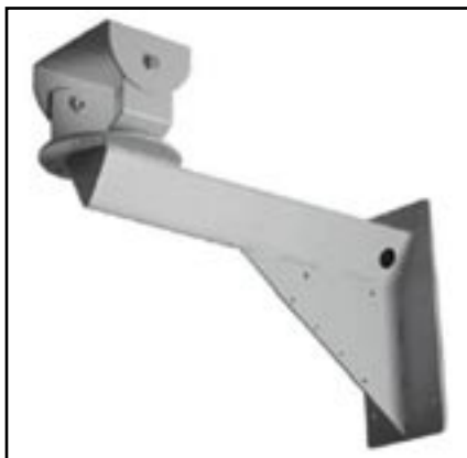
Figure 7. Pelco wall mount.