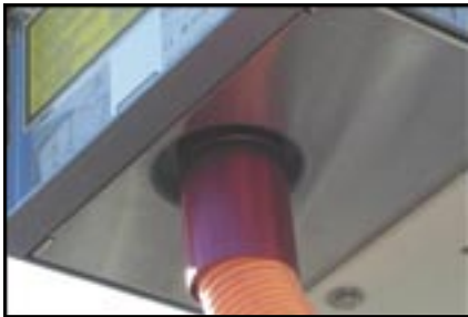
Figure 11. Conduit adapter.

mends the Trylon 5.951.0049.005 (see www.trylon.com ).