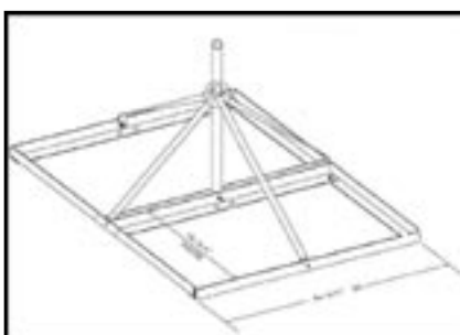
Figure 9. Rohn/Radian FRM238 non-penetrating mount.

or sandbags, is an option where penetrating mounts are not possible. In general, the mounting frames should be metal, not wood. Wood warps and shrinks enough to cause alignment problems over time.