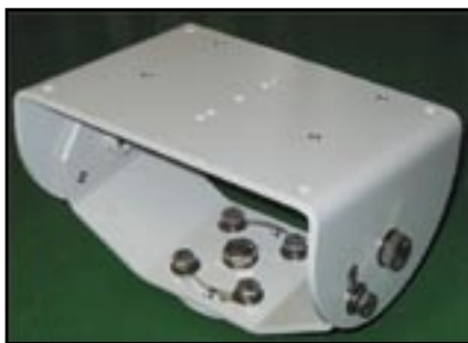
Figure 6. Canobeam swivel mount.

For non-penetrating mounts, Canobeam recommends the Rohn/Radian FRM 238 due to its low, 30-inch mast height ( www.criticaltowers.com ). This mount is optimal for roofs with low or no parapet. For non-penetrating installations that require a mounting height above 30 inches, Canobeam recom-