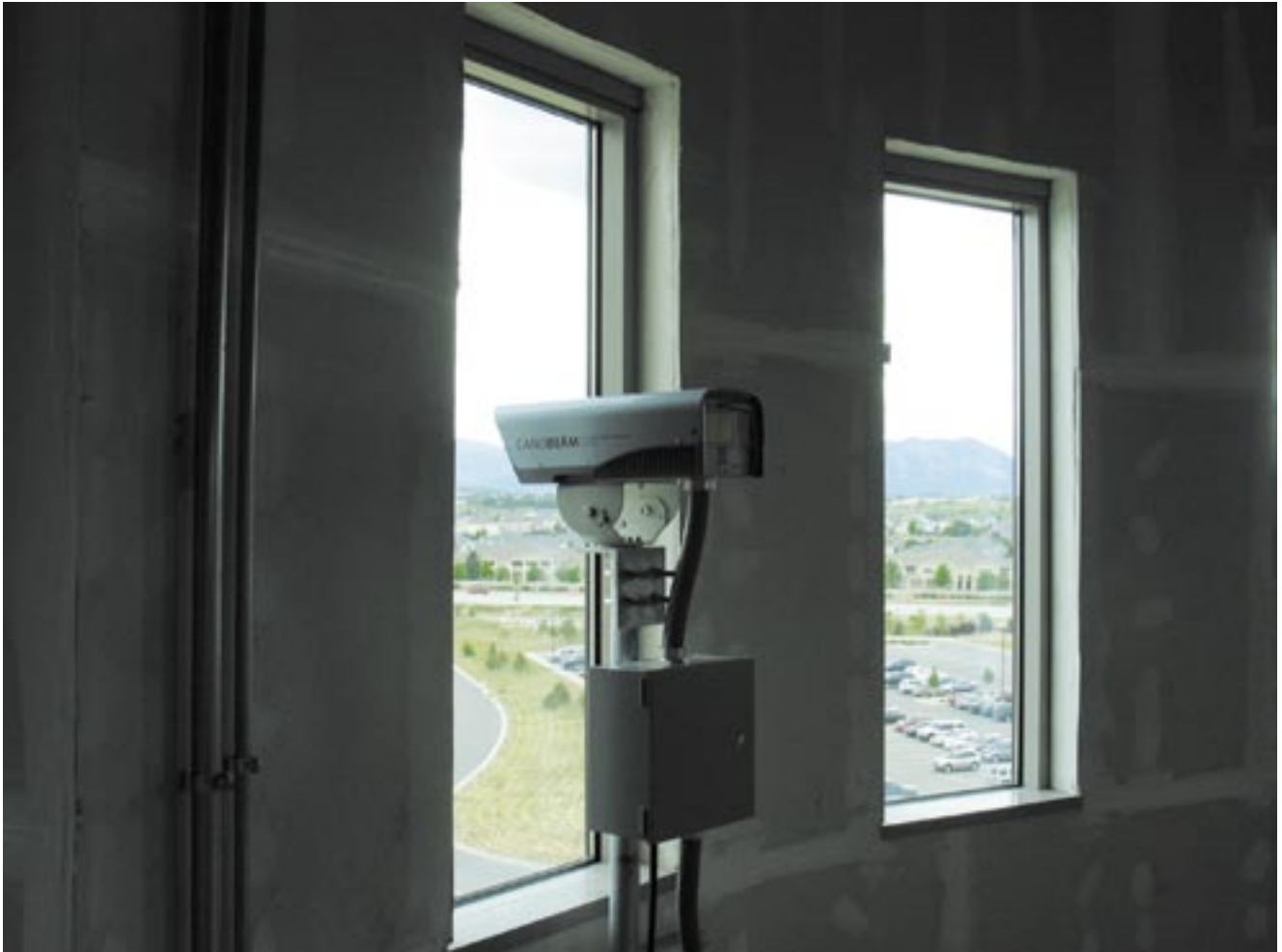
Figure 5. Indoor mount. Note how the FSO is tilted a bit, relative to the glass. See text for details.

ceiver, interrupting the optical path. The Canobeam can take up to 6 minutes to recover and resume transmitting. This exists to protect the receiver.